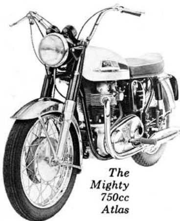
The Mighty 750cc Atlas

We ask you to visit a Norton dealer. Read some road tests before you go in. Ask the dealer questions. The more you know about the Norton, the more you'll like the Norton.